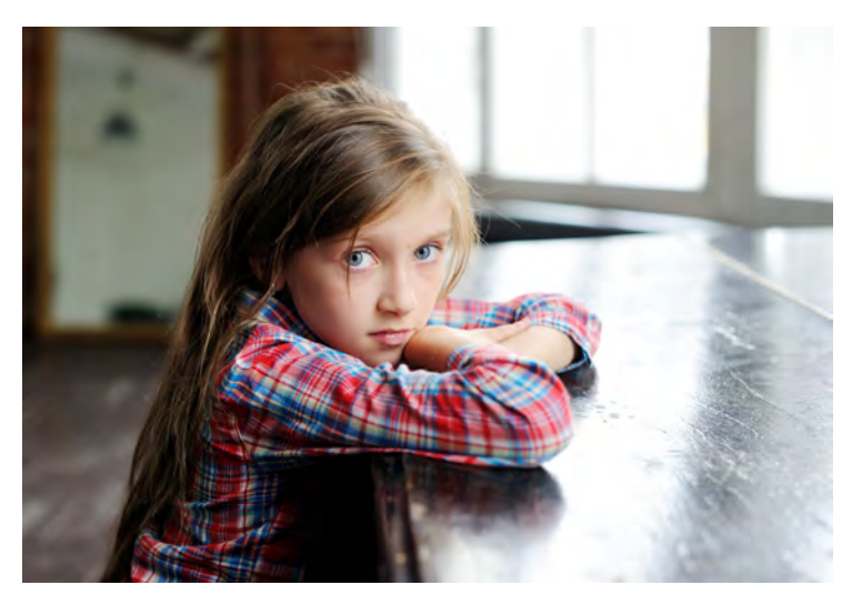
Your gift will provide a local child in need with a new backpack full of the essential school supplies they need to return to school ready to learn.

a brand new backpack filled with pens, pencils, paper, binders, glue sticks and so much more – all the school supplies required by local schools and everything a child needs to be ready to learn.